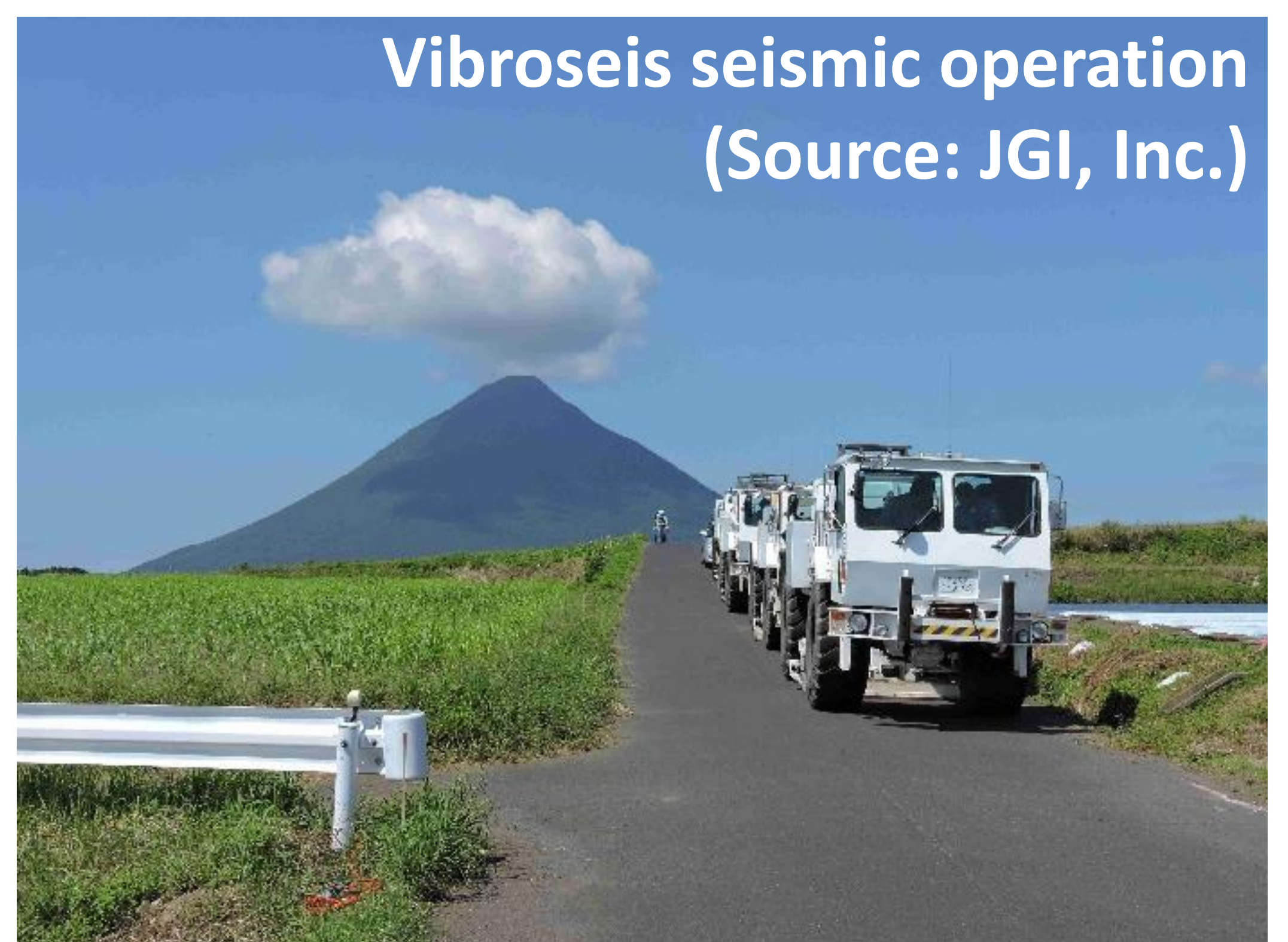
Vibroseis seismic operation

The Society of Exploration Geophysicists of Japan (SEGJ) Higashi-kanda MK No.5 Bldg., 1-5-6 Higashi-kanda, Chiyoda-ku, Tokyo 101-0031, Japan Phone +81-3-6804-7500 Fax +81-3-5829-8050 e-mail: office@segj.org http://www.segj.org/index_e.html