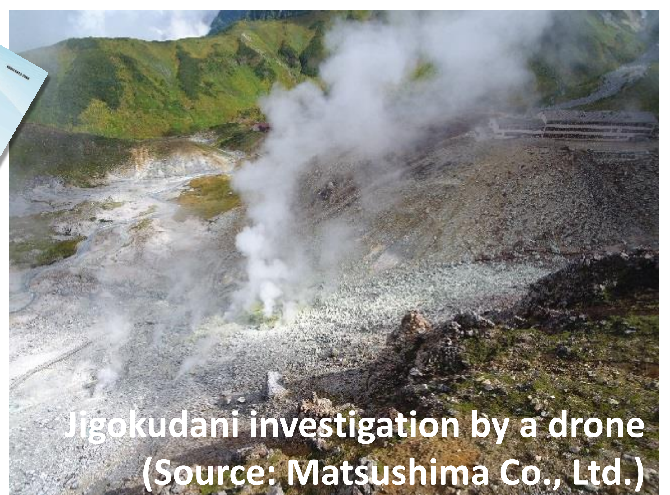
Jigokudani investigation by a drone

SEGJ was reorganized as a general incorporated association in 2001, and then as a public interest incorporated association in 2013. SEGJ has been responsible in promoting exploration activities and information dissemination in public as well. And SEGJ now reinforces the activities for the disaster prevention and control and maintenance of social infrastructure as the public service.