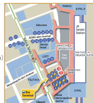
Bus Stop Number at the Sendai St.

For more information about Sendai travel information, please visit the following website: http://sentabi.jp/